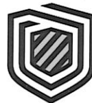
Construction Safety Association of Manitoba Executive Director

CSAM CONSTRUCTION SAFETY ASSOCIATION OF MANITOBA